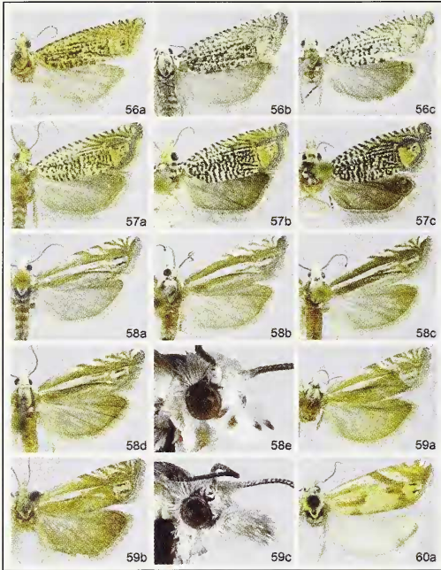
Figure 2. One of the adult habitus plates from the book.